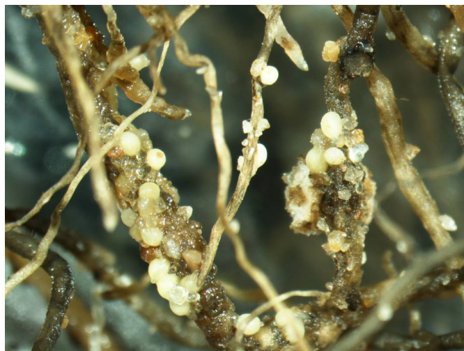
Figure 2. White bodies of female SCN protruding out from soybean roots.

SCN is a plant-parasitic nematode, which is a microscopic roundworm. SCN has three stages: egg, juvenile, and adult. After hatching, juvenile worms enter soybean roots to feed. There they become either male or female. Adult males leave the soybean root in the worm form, whereas females swell to a lemon shape and become immobile. As they grow, the female nematodes no longer fit within the root and begin to break through the root surface. The heads remain embedded while their white bodies bulge from the root (Figure 2). The males fertilize the females whose bodies then turn yellow with age and brown when they die. The brown cysts, which contain eggs that can remain protected in the cyst for several years, drop off roots and become the overwintering stage.