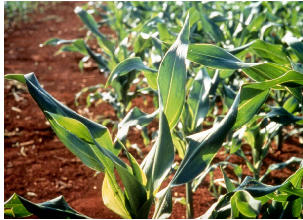
Figure 11. Copper (Cu) Deficiency in Corn

Boron (B) Deficiency in Corn.