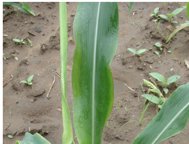
Figure 6. Calcium (Ca) Deficiency in Corn

Magnesium (Mg) Deficiency in Corn. Photo is provided courtesy of the International Plant Nutrition Institute (IPNI) and its IPNI Crop Nutrient Deficiency Image Collection, P. Kumar