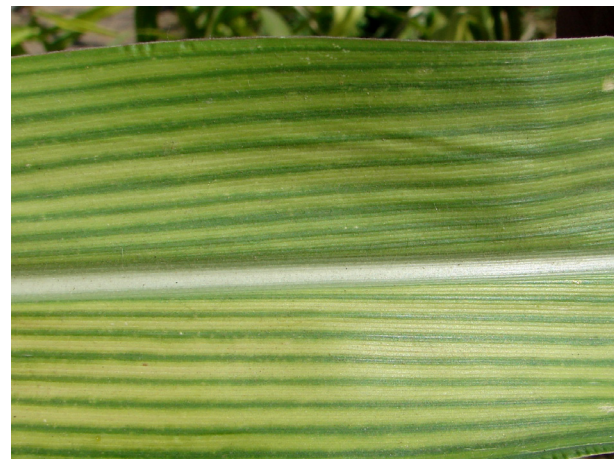
Figure 7. Iron (Fe) Deficiency in Corn

Calcium (Ca) Deficiency in Corn.