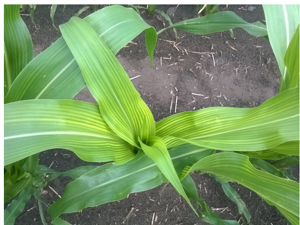
Figure 12. Sulfur (S) deficiency in Corn

Even though nutrient management is a complex process, improving understanding of uptake timing and rates, partitioning, and remobilization of nutrient by corn provides opportunities to optimize fertilizer rates and application timing.