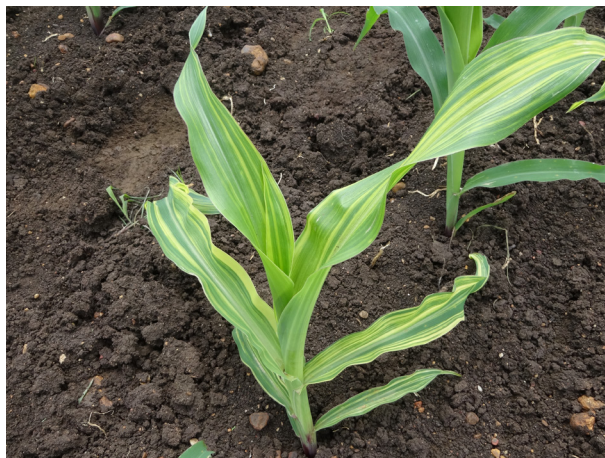
Figure 8. Zinc (Zn) Deficiency in Corn

Iron (Fe) Deficiency in Corn.