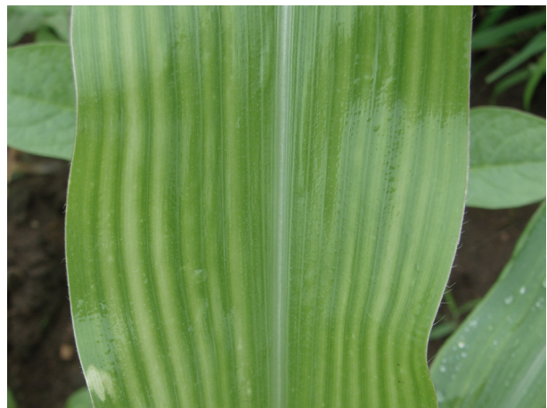
Figure 9. Manganese (Mn) Deficiency in Corn

Zinc (Zn) Deficiency in Corn.