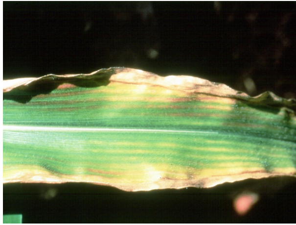
Figure 4. Potassium (K) Deficiency in Corn

Potassium (K) Deficiency in Corn.