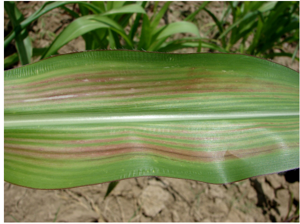
Figure 5. Magnesium (Mg) Deficiency in Corn

Potassium (K) Deficiency in Corn.