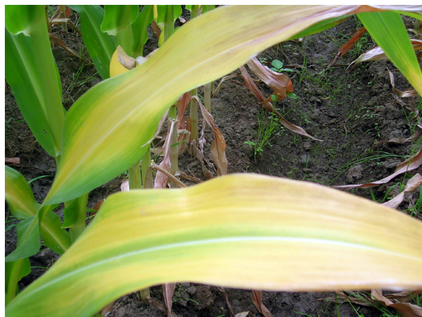
Figure 2. Nitrogen (N) Deficiency in Corn

The following pictures represent some of the more common nutrient deficiency symptoms in corn. When visual symptoms of nutrient deficiency particularly N and K, yield loss has occurred.