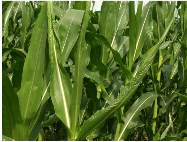
Figure 10. Boron (B) Deficiency in Corn

Boron (B) Deficiency in Corn.