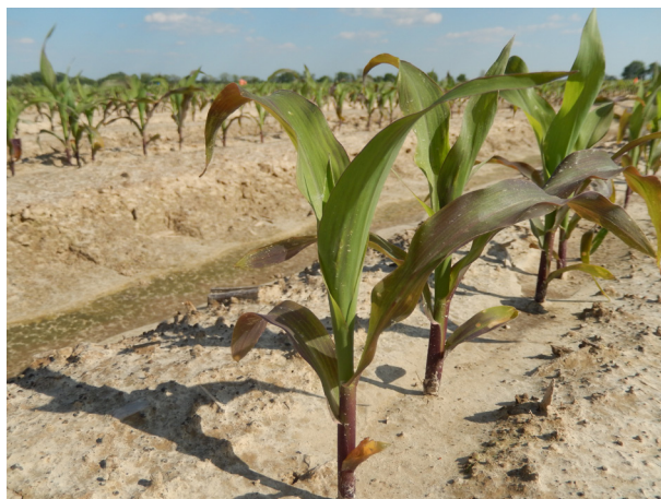
Figure 3. Phosphorous (P) Deficiency in Corn

Nitrogen (N) Deficiency in Corn.